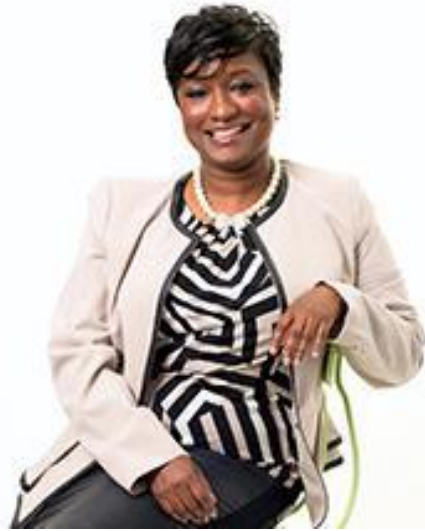
Legislative Director Office of the Mayor