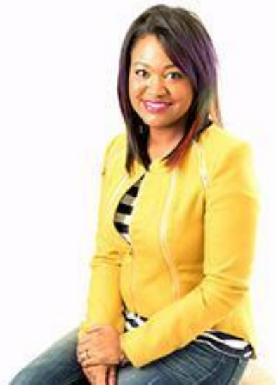
Owner Malina Simone Inc.